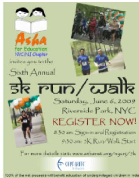
your logo on the flier