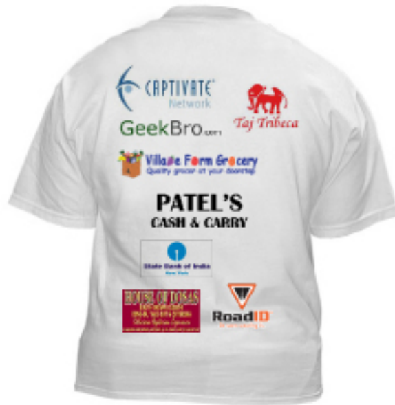
your logo on 5k t-shirts