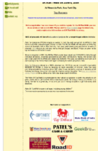
your logo on 5k website