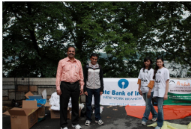
your banner at riverside park